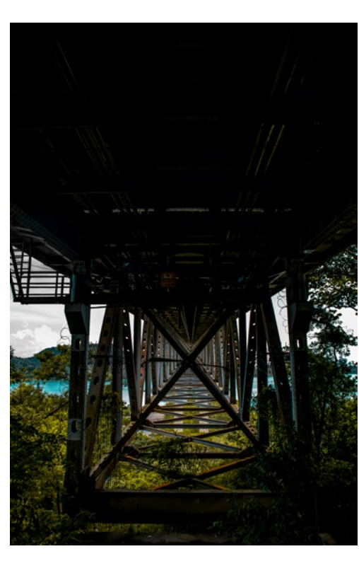
Alexandra Gelis, still from Bridge of the Americas , 2015, single channel video with sound, 2:30 minutes, Courtesy of the Artist

Click! aims to expand dialogue between artists and the public by assembling photographs—both online and in the gallery—that are submitted by the public throughout the run of the exhibition. As a community art project, it references participatory events in Latin America beginning in the middle of the twentieth century.