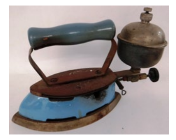
Kerosene Fired Iron, Collection of Museum London, 1993