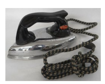
Electric Iron, Collection of Museum London, 2011