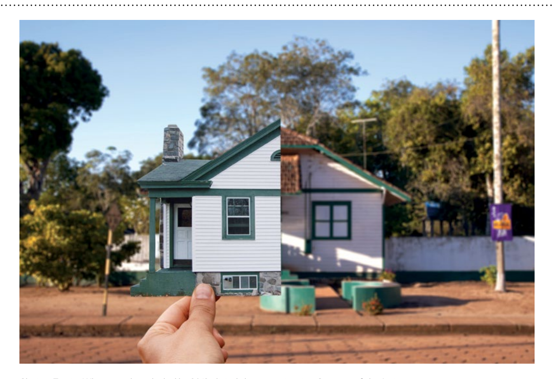
Clarissa Tossin, When two places look alike, 2013, digital chromogenic print, Courtesy of the Artist