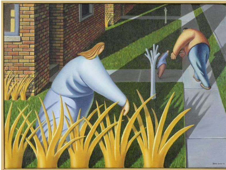
Image: Brian Jones, Yard Scene # 1 , 1978, oil on canvas, Collection of Museum London, Gift of Richard and Beryl Ivey, London, Ontario, 1989