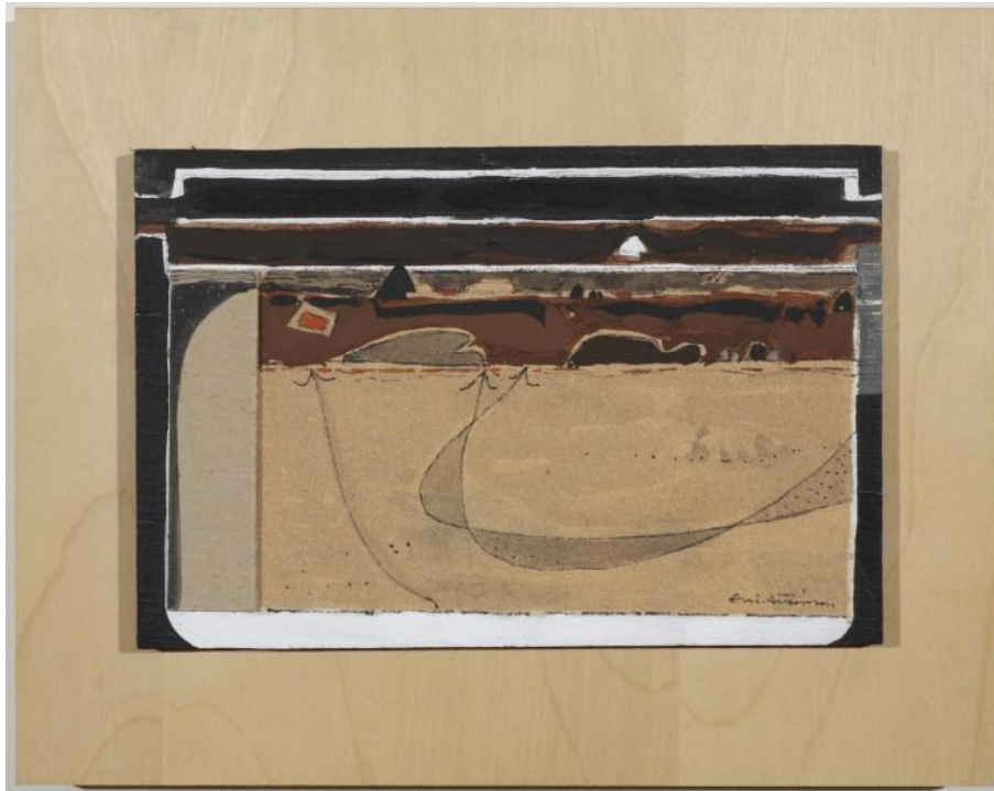
Image: Eric Atkinson, Huron Series 4 & 5 , 1994, acrylic and graphite with sandpaper, Collection of Museum London, Gift of the Estate of Ethel May Horn, 2007