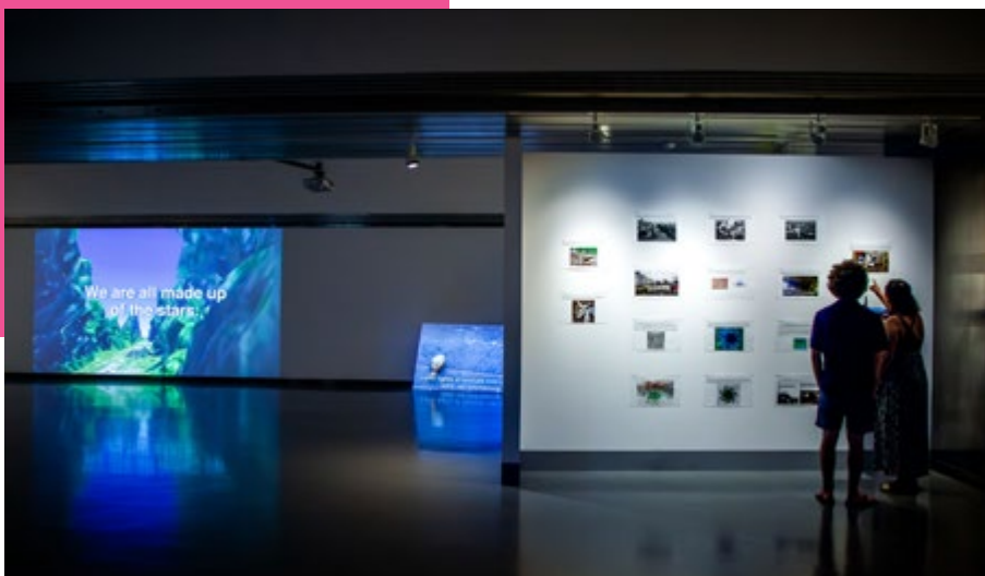
Installation view, Christina Battle: Under Metallic Skies , June 1 to November 3, 2024.

In Under Metallic Skies , she reconfigured ongoing projects, placing older and newer works side by side to spark fresh interpretations. These pieces explored themes of emergence, equitable economies, and both biological and social remediation, fusing aesthetics, activism, and interdisciplinary research.