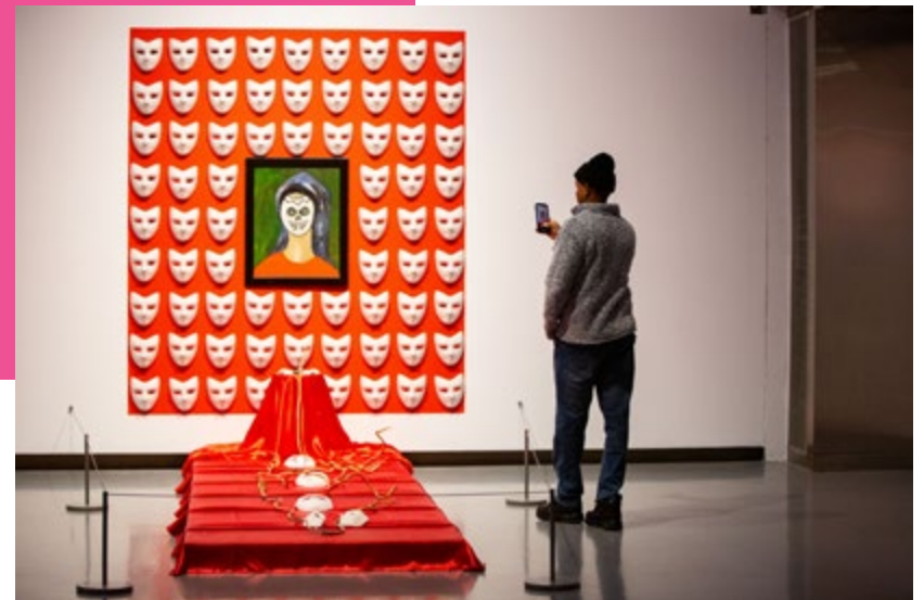
Installation view, Ukutula: Our Timeless Journeys, November 21, 2024 to May 11, 2025.

Employing photography, new media and video, textile installation and more, the artists of Ukutula: Our Timeless Journeys reflected on diasporic roots by exploring themes of identity, transformation, the body, belonging, place and regional histories. The exhibition collectively invited us to explore the relationship between the past and present, and how our physical and spiritual journeys shape who we are.